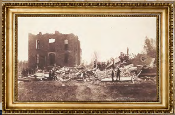
GRINNELL, IOWA JUNE 17, 1882 8:44 PM