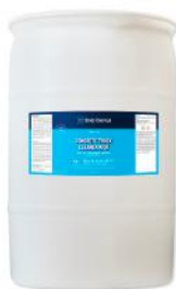
KICK ACID CONCRETE TRUCK CLEANER 4101 Cleans like an acid with the safety of a dish soap!