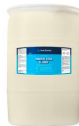
CONCRETE TRUCK CLEANER 102108 Up to 90% less fumes than standard hydrochloric acid!