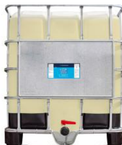
BLAST AWAY 2108 Organic salt and Phos- phoric blend that bright- ens and removes con- crete in one easy step!