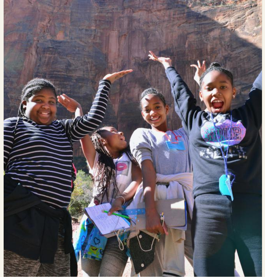
ZFP STRATEGIC PLAN 2026-2031

We believe that everyone should be able to access, enjoy, and feel welcome in Zion National Park and the other public lands we serve.