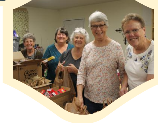
A recipient of Caregivers Shopping Services

"My volunteer provides so much more than shopping. She brings a smile to my door. I can stay in my home because of my volunteer!"