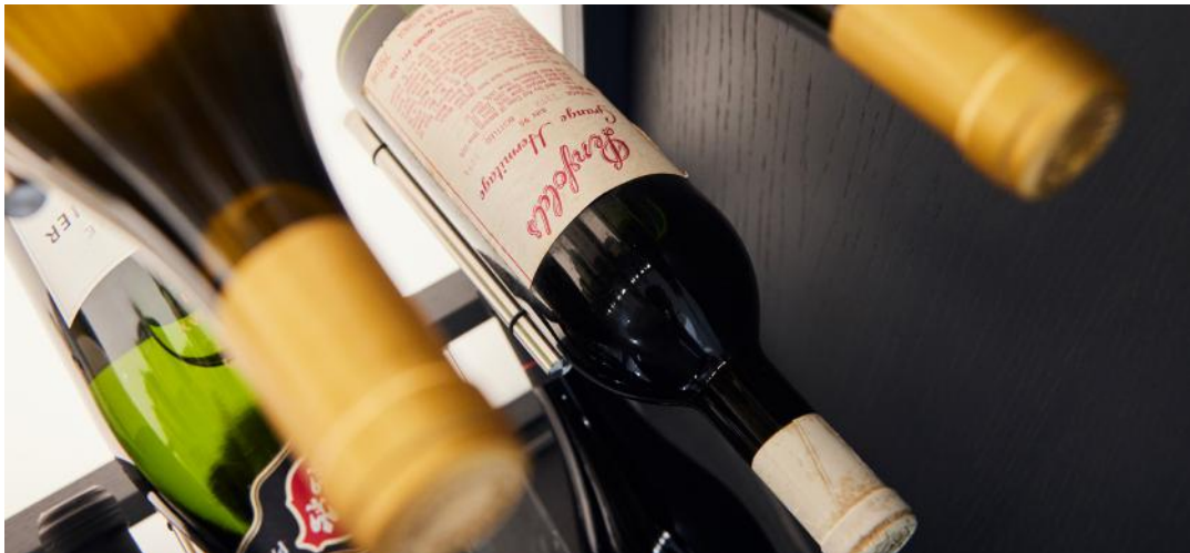
Stainless-steel bottle display.