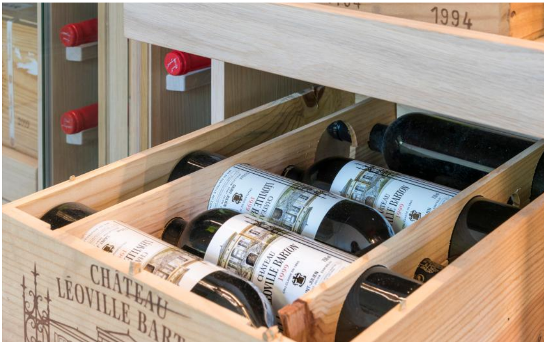
Light oak storage, Back-lit acrylic bespoke stainless steel bottle displays.