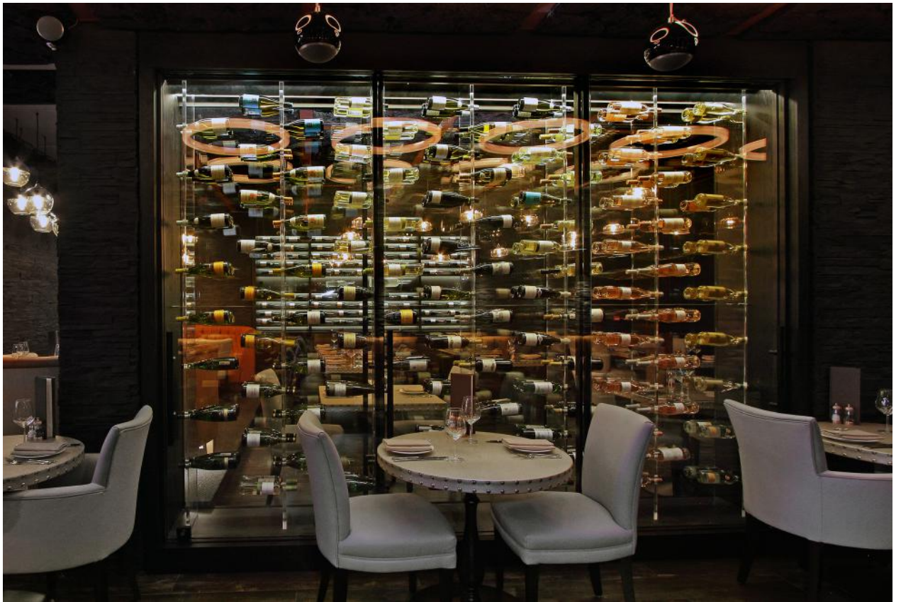
Bespoke feature metalwork and acrylic.