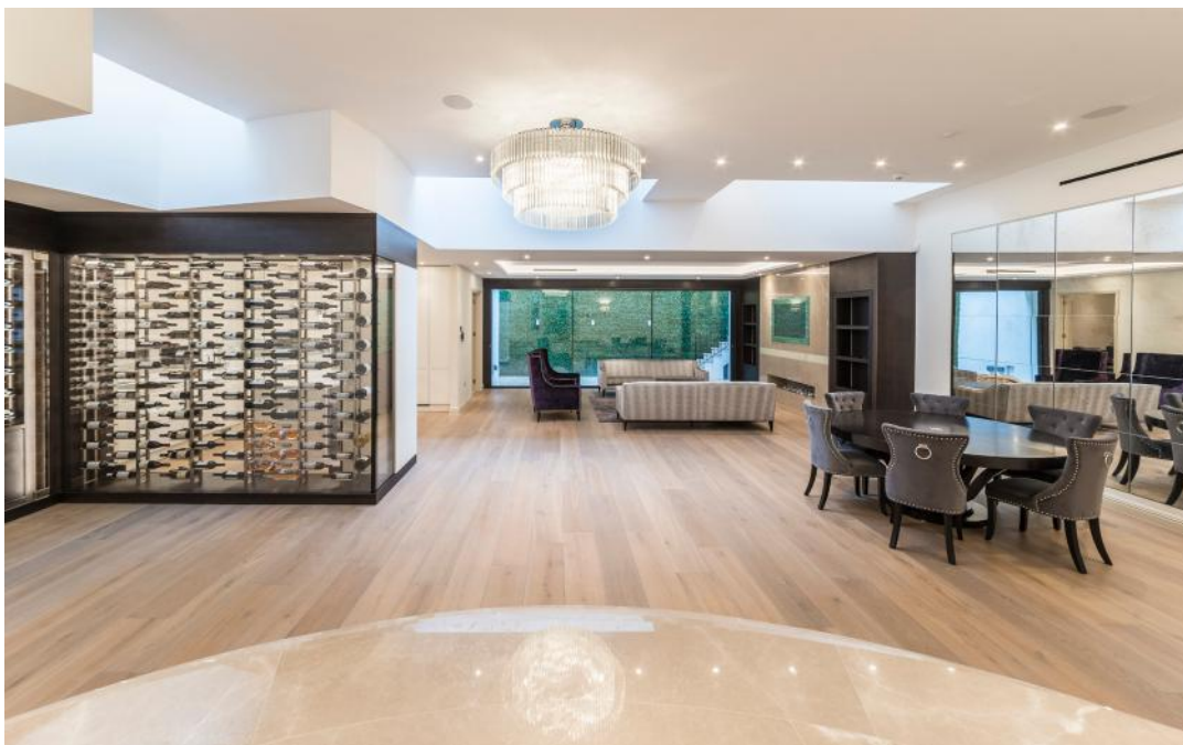
Blend of classic oak joinery and contemporary stainless steel