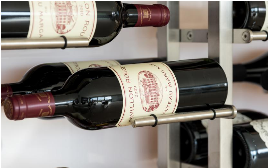
Blend of classic oak joinery and contemporary stainless steel