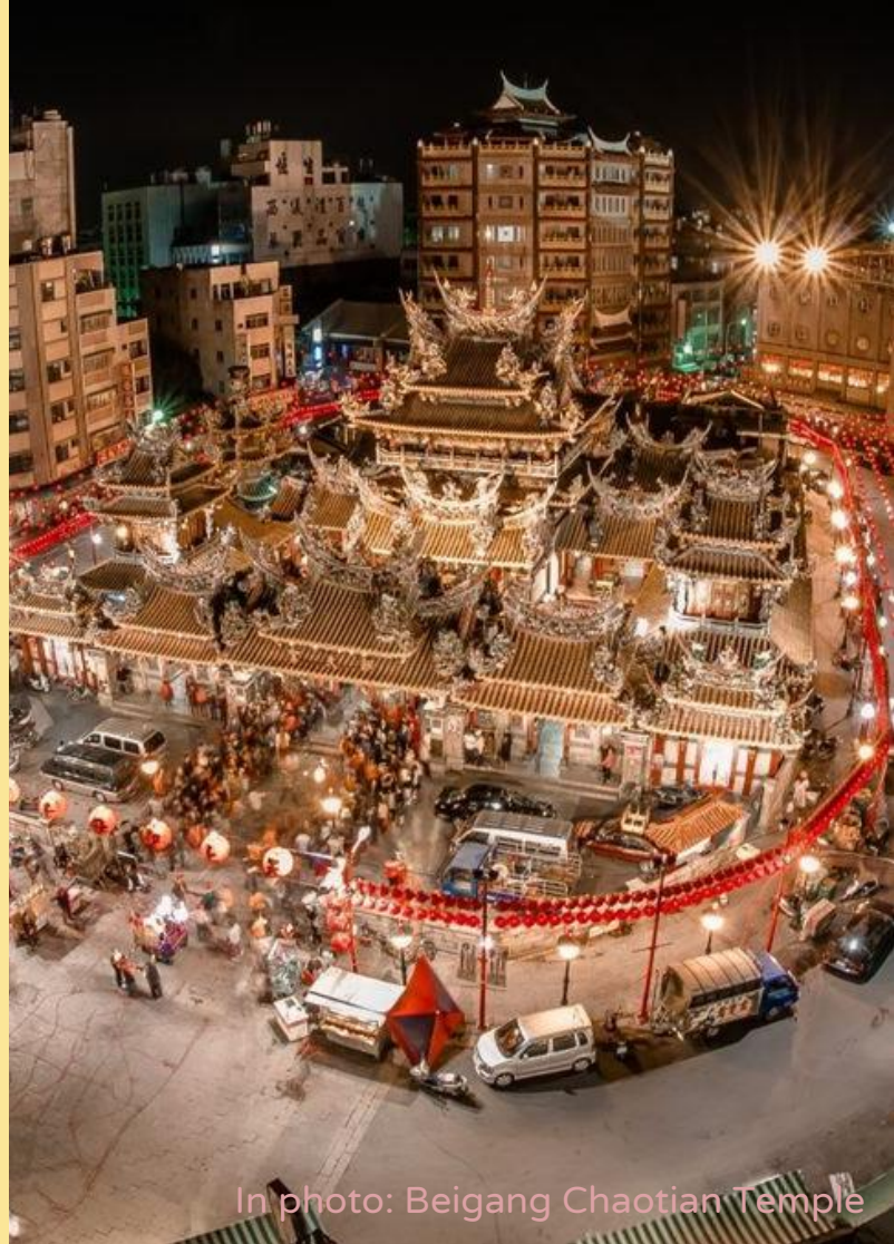
In photo: Beigang Chaotian Temple

Yunlin comes alive with vibrant festivals that showcase the joyous spirit of its people. From the lively lantern festivals to the colorful parades, each celebration is a testament to the county's cultural vitality. Beigang Chao-Tian Temple, a revered religious site, hosts grand festivities, attracting visitors from near and far.