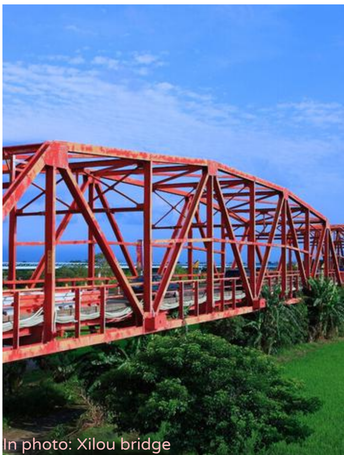
In photo: Xilou bridge

Welcome to Yunlin County, a place where vibrant traditions, diverse cultures, and the beauty of nature come together! Nestled in the heart of Taiwan, Yunlin County is a tapestry of rich history and warm hospitality that will captivate your senses.