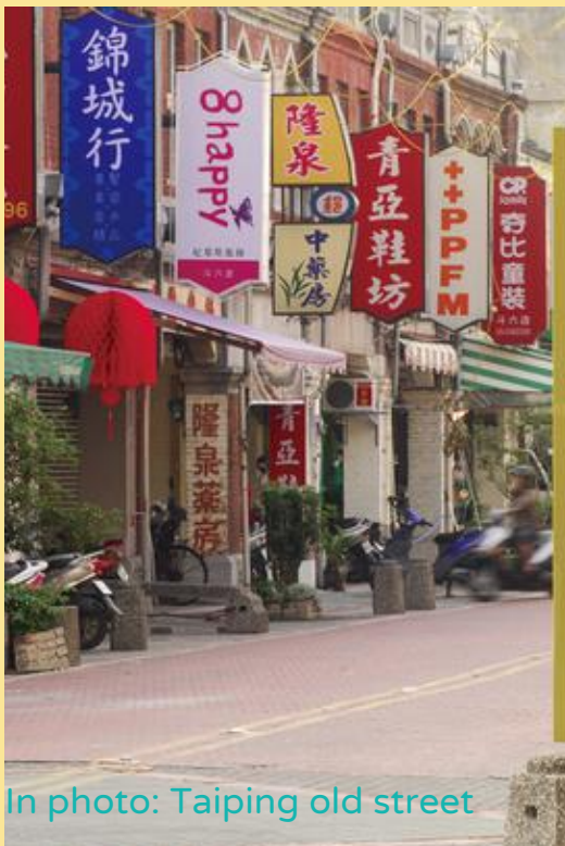
In photo: Taiping old street