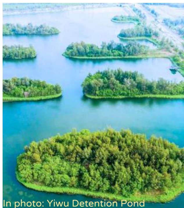
In photo: Yiwu Detention Pond

Imagine endless fields of emerald-green rice paddies waving in the gentle breeze – that's the picturesque landscape of Yunlin. Known as an agricultural heartland, the county is celebrated for its bountiful harvests of rice, fruits, and vegetables. Farming isn't just an occupation here; it's a way of life that has been passed down through generations.