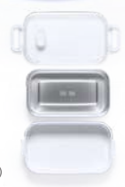
Plastil 1938 800 ml

21.3 x 6.4 x 11.3 cm 30 Print Code: F(1)