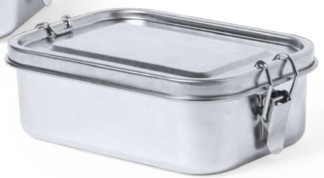
Yalac 1123 750 ml

17 x 12.1 x 6 cm 30 Print Code: F(1), L2