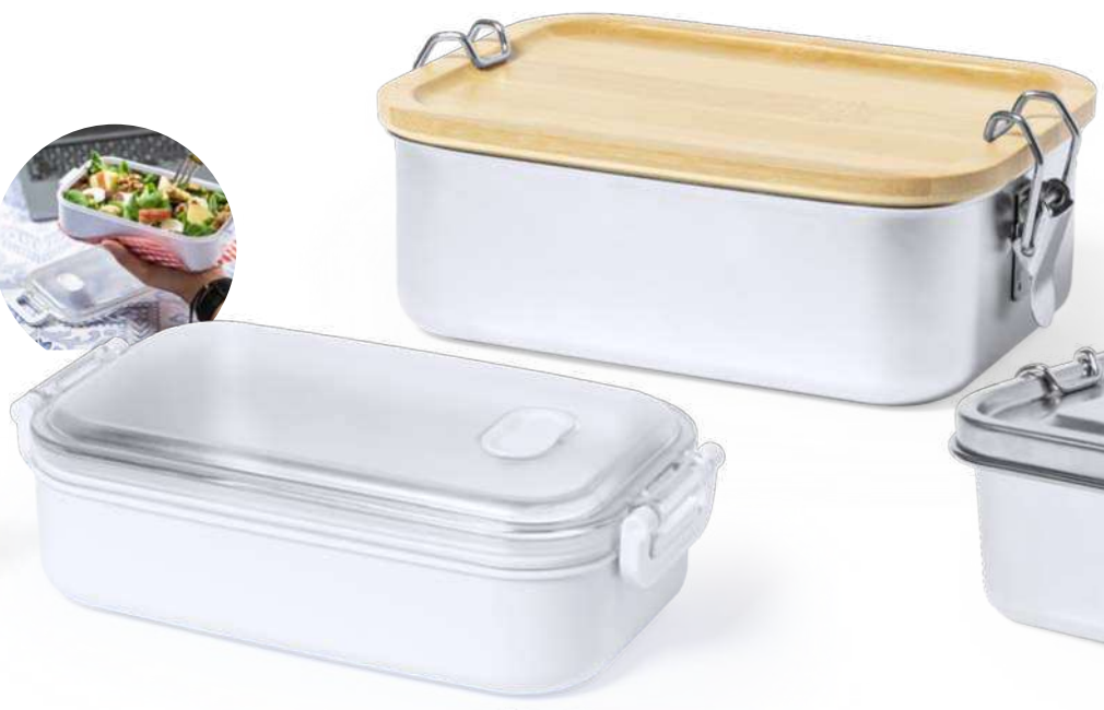
Veket 1482 500 ml

Gamelle Thermique. PP/ Acier Inox. 500 ml. Thermal Lunch Box. PP/ Stainless Steel. 500 ml.