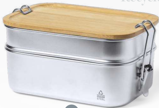
Vickers 1742 940 ml

Gamelle. Acier Inox Recyclé/ Bambou. 2 Compartiments 340 et 600 ml. Fermeture Sécurité. Lunch Box. Recycled Stainless Steel/ Bamboo. 2 Compartments 340 and 600 ml. Safety Catch.