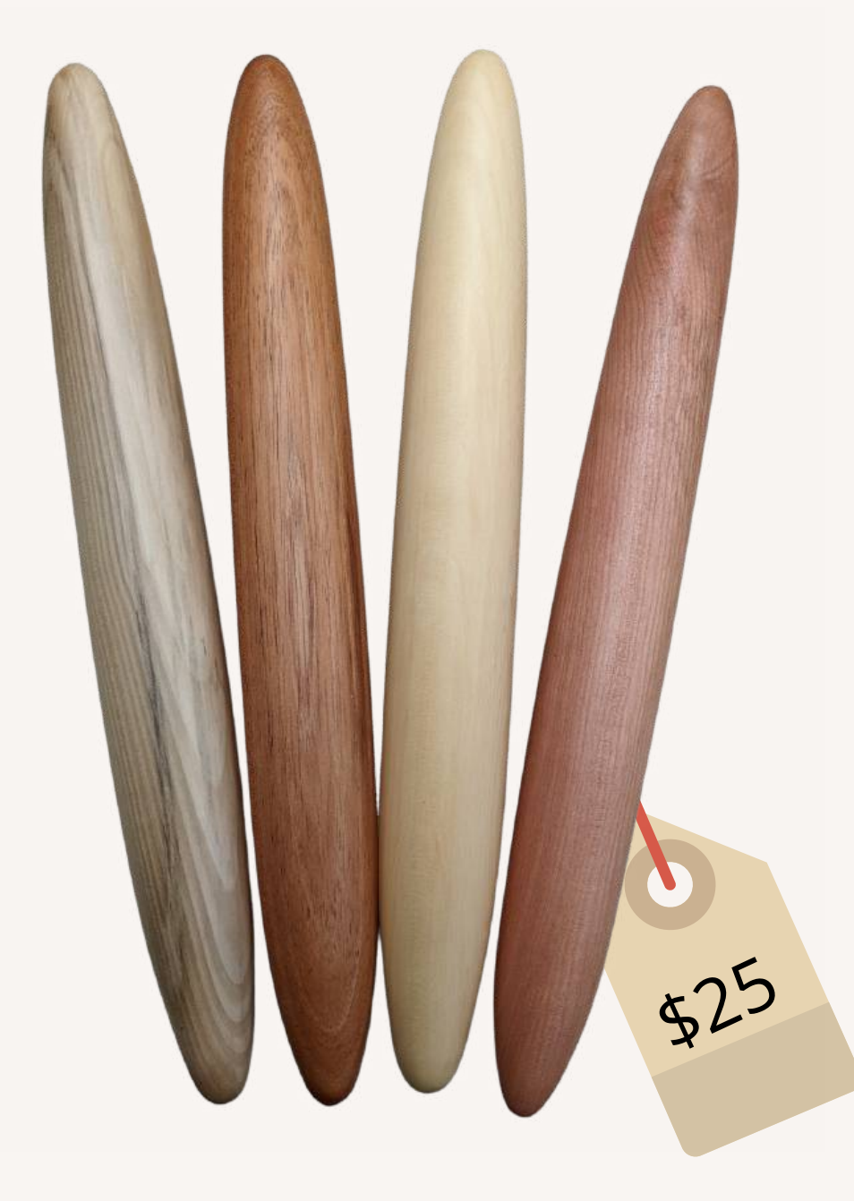
French style rolling pins (360mm)