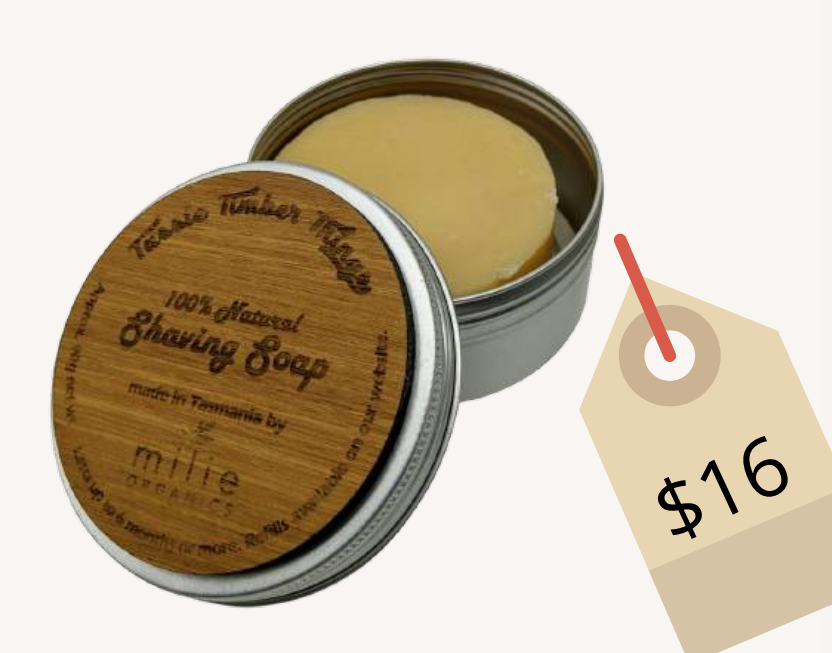
Natural shaving Soap in a Tin