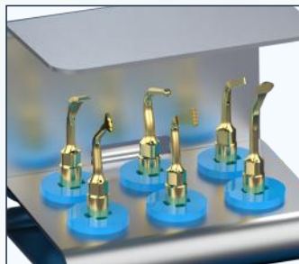
Basic Tips Kit US1/ US2*2/ US4 / US5/ UL3 / UC1 6 types (Equipped with 7 tips)