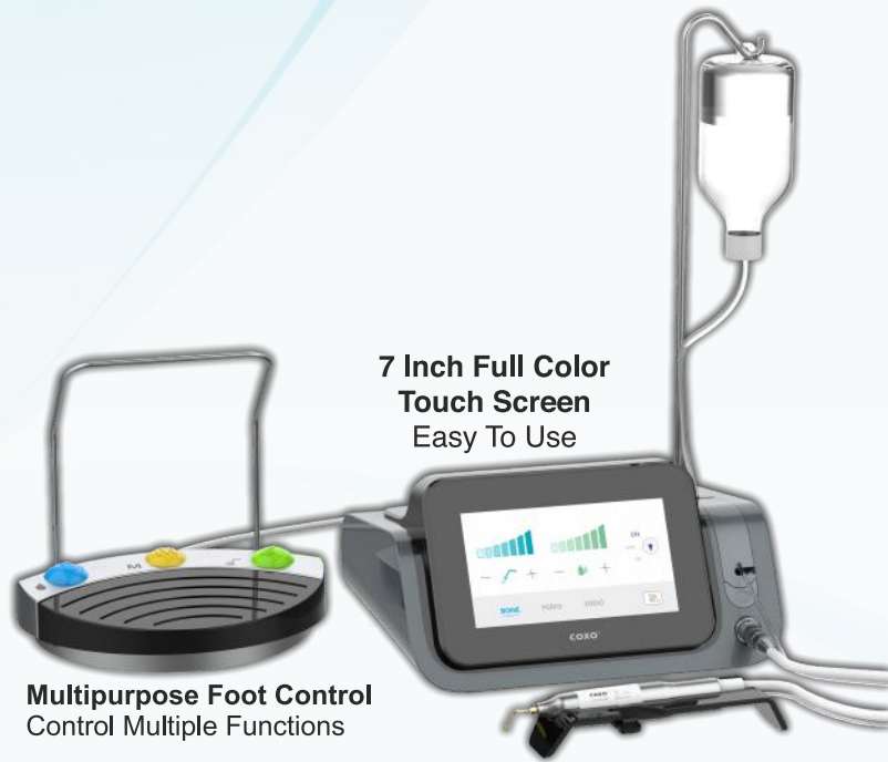
7 Inch Full Color Touch Screen Easy To Use