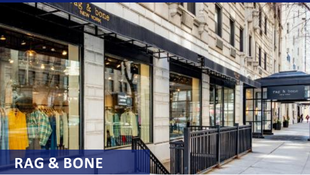
RAG & BONE