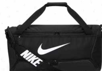
BRASILIA MEDIUM DUFFEL