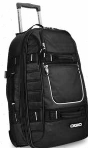
PULL THROUGH BAG