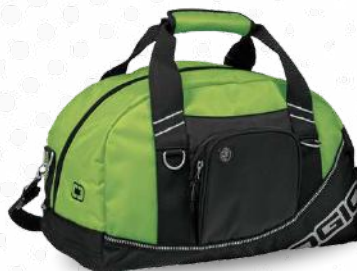
HALF DOME DUFFLE