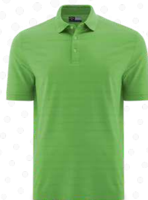
OPTI-VENT POLO SHIRT