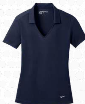
VERTICAL MESH LADIES MESH POLO