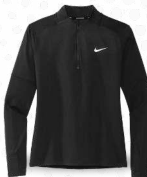
DRI-FIT ELEMENT HALF ZIP LADIES