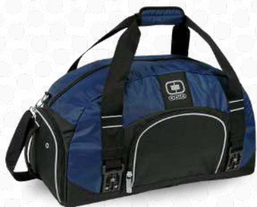
BIG DOME DUFFLE BAG