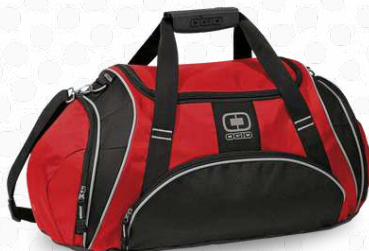
CRUNCH DUFFLE BAG