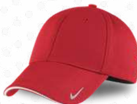
MESH FLEX SANDWICH CAP