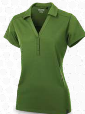
FRAMEWORK LADIES POLO