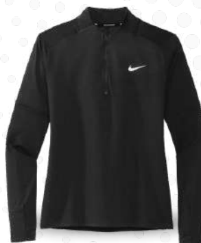
DRI-FIT ELEMENT HALF ZIP LADIES