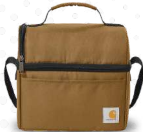
LUNCH 6 CAN COOLER 11L