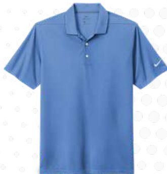
DRI-FIT 2.0 POLO SHIRT