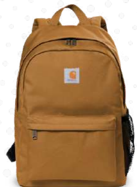
CANVAS BACKPACK 12L