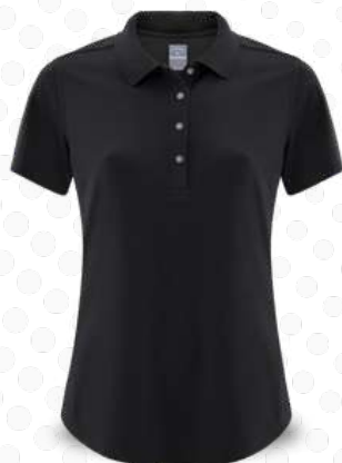
CORE PERFORMANCE LADIES POLO SHIRT