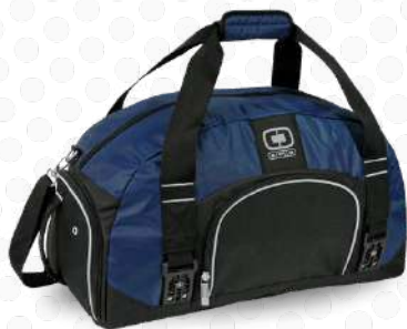
BIG DOME DUFFLE BAG