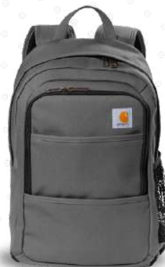
FOUNDRY SERIES BACKPACK 23L