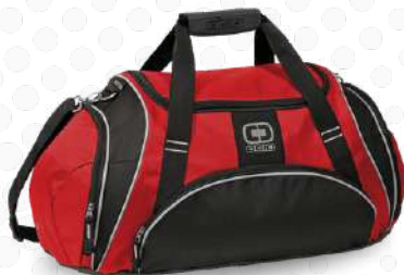
CRUNCH DUFFLE BAG