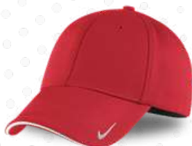
MESH FLEX SANDWICH CAP