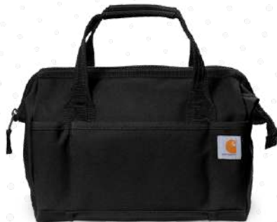
FOUNDRY SERIES TOOL BAG. 24L