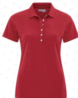
OPTI-VENT LADIES POLO