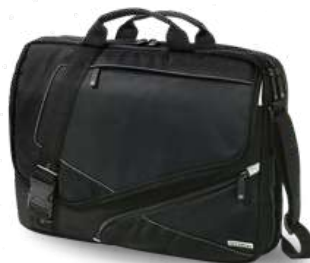
VOYAGER MESSENGER BAG