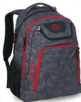
EXCELSIOR 17" LAPTOP BACKPACK