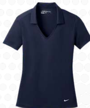
VERTICAL MESH LADIES MESH POLO