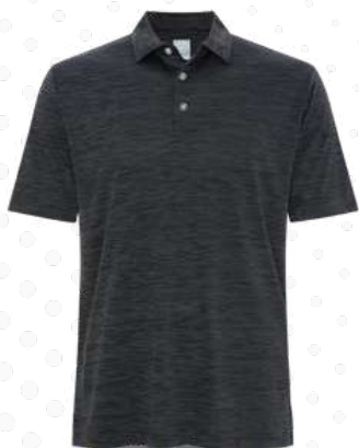
BROKEN STRIPE TEXTURE POLO