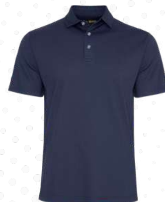
BIRDSEYE POLO SHIRT