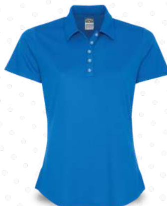
BIRDSEYE LADIES POLO SHIRT