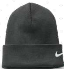
TEAM BEANIE HAT