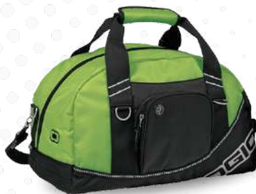
HALF DOME DUFFLE