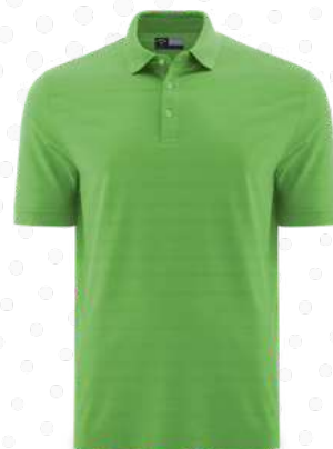
OPTI-VENT POLO SHIRT