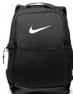
BRASILIA MEDIUM BACKPACK