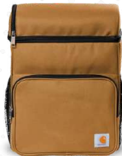
BACKPACK 20- CAN COOLER