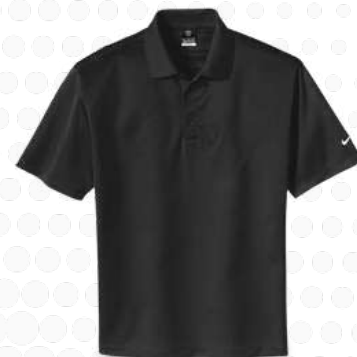
BASIC DRI-FIT POLO