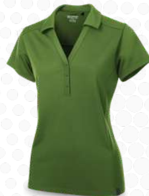
FRAMEWORK LADIES POLO