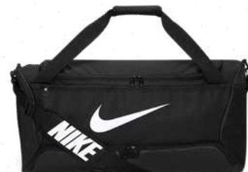
BRASILIA MEDIUM DUFFEL