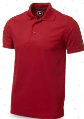
CALIBER 2.0 POLO SHIRT