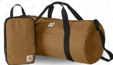
CANVAS PACKABLE DUFFLE WITH POUCH 40L