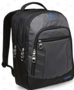
COLTON LAPTOP BACKPACK