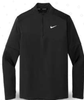
DRI-FIT ELEMENT HALF ZIP TOP