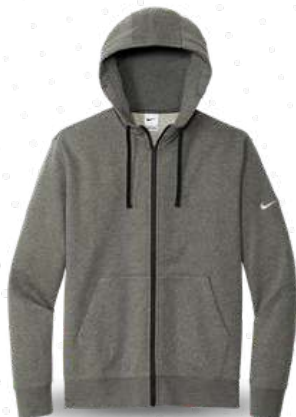
FULL ZIP HOODIE