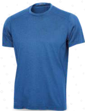
ENDURANCE PULSE CREW T-SHIRT