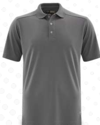
CORE PERFORMANCE POLO SHIRT