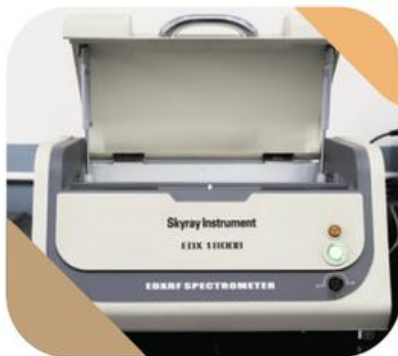
ROHS Analysis Meter

Our flooring is rigorously tested to meet the highest standards of craftsmanship and performance. Crafted to be as safe as they are beautiful, each Merrinton floor is free from harmful toxins, exceptionally durable, and designed to bring enduring elegance to your space.