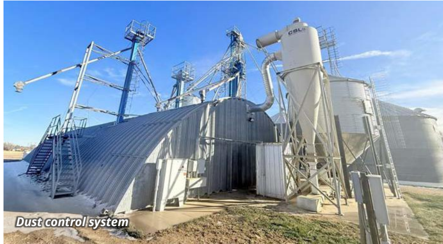
Dust control system

DUST CONTROL: Dust control system inside the Quonset pulls dust from the cleaning equipment via a 40 CFM fan setting on top of the cyclone.