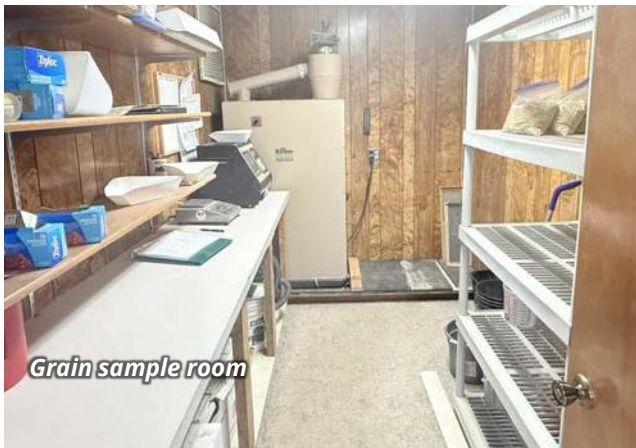
Grain sample room