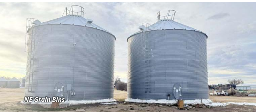
NE Grain Bins

SEED TREATER: LPX2000 wheat seed treater, automatic calibration with three (3) pump stands. A 500-bushel Meridan hopper bottom bin sets over seed treater with scale and printer.