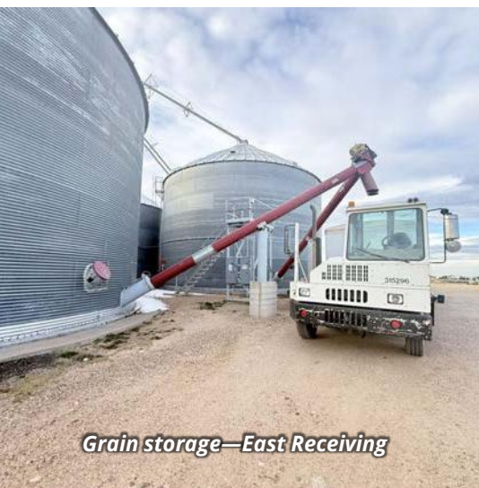
Grain storage—East Receiving