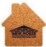
HOUSE SHAPED COASTER