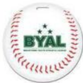
BASEBALL SHAPED LUGGAGE TAG