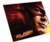
6" X 7" MICROFIBER CLEANING CLOTH