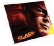
6" X 7" MICROFIBER CLEANING CLOTHS