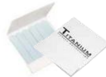
MATCHBOOK NAIL FILE