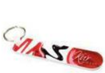
FULL COLOR 3.5" NAIL FILE