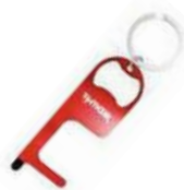
NO TOUCH TOOL WITH STYLUS