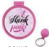
ROUND COMPACT MIRROR