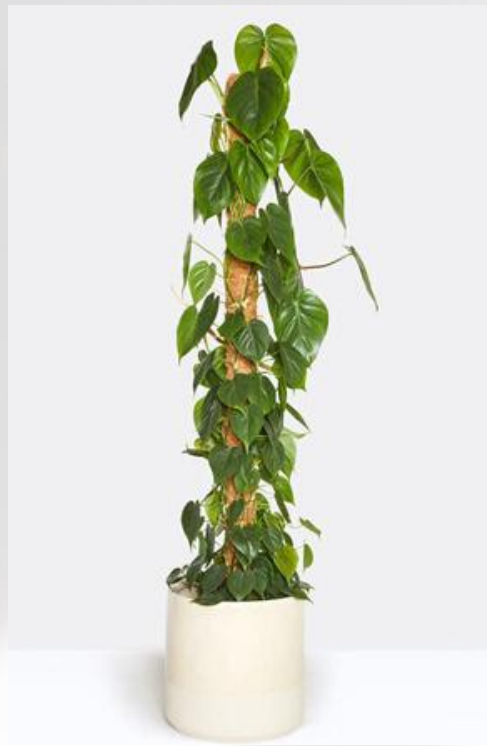
Philodendron e. red emerald