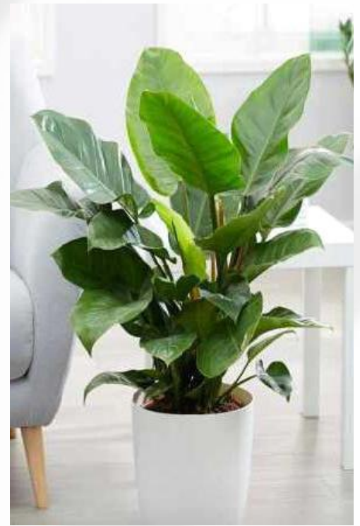
Philodendron imperial green