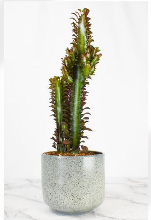
Euphorbia trigona rubra Anthurium - African milk tree