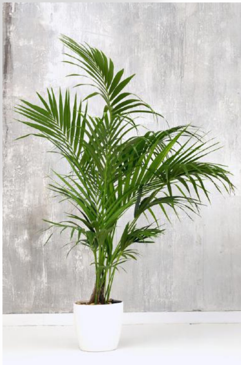
Howea Forsteriana - Kentia Palm