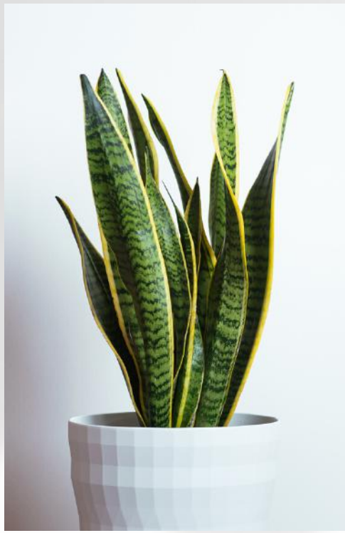
Sansevieria trifasciata - Snake Plant