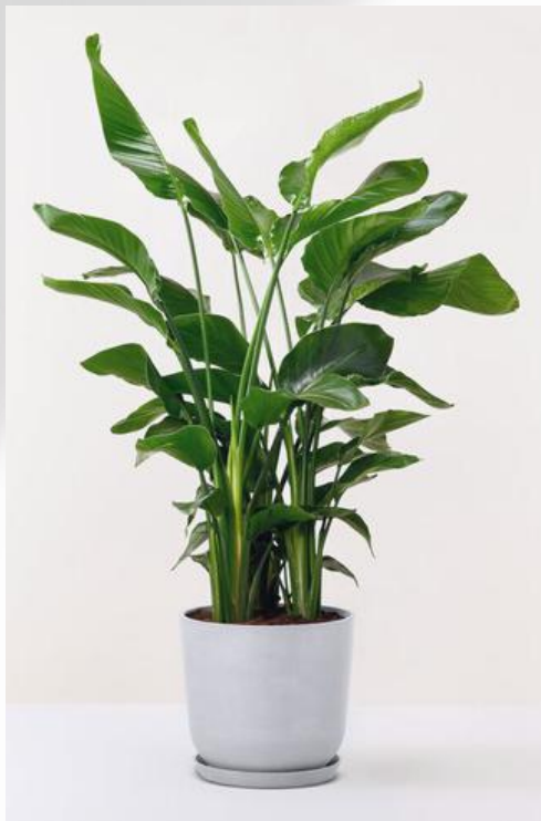
Strelitzia Nicolai - Bird of Paradise