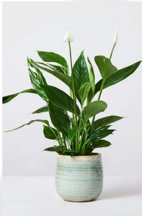
Spathiphyllum sweet Lauretta - Peace Lily