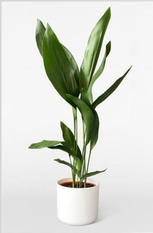
Aspidistra elatior - Cast Iron Plant