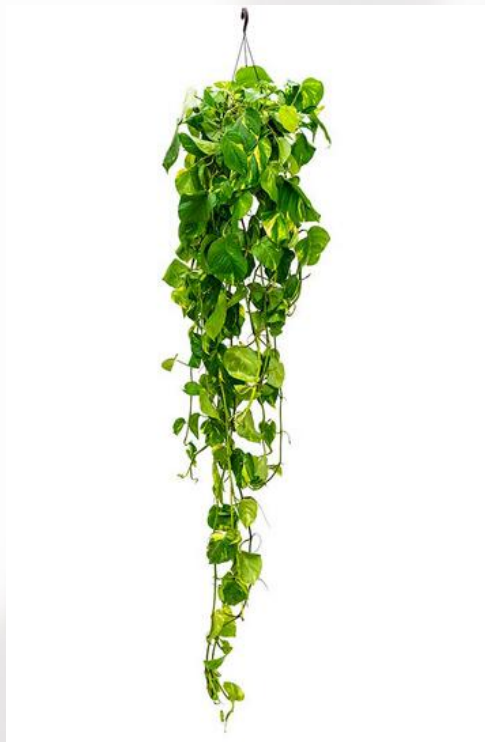
Epipremnum Aureum - Golden Pothos