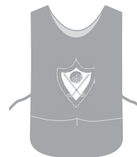
"A" Caddies Silver