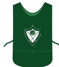
"B" Caddies Hunter Green