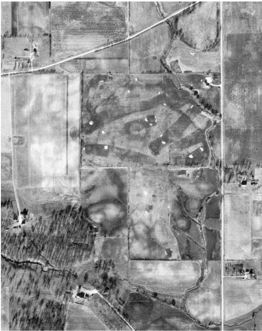
Aerial view of the course and surrounding area in 1938.