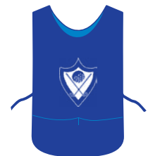
Honor Caddies Blue

Of note, caddies are assigned based on the time stamp on your golf reservation on Foretees. Last minute caddie requests may or may not be filled based on availability. I will always do my best to be as accommodating as possible.