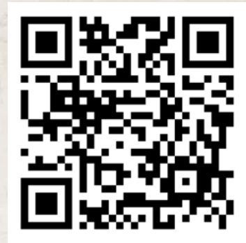
Scan to share your story!

Scan the QR code to access a short form where you can share your story and upload photos or documents. Thank you for helping us celebrate 100 years of Inverness.