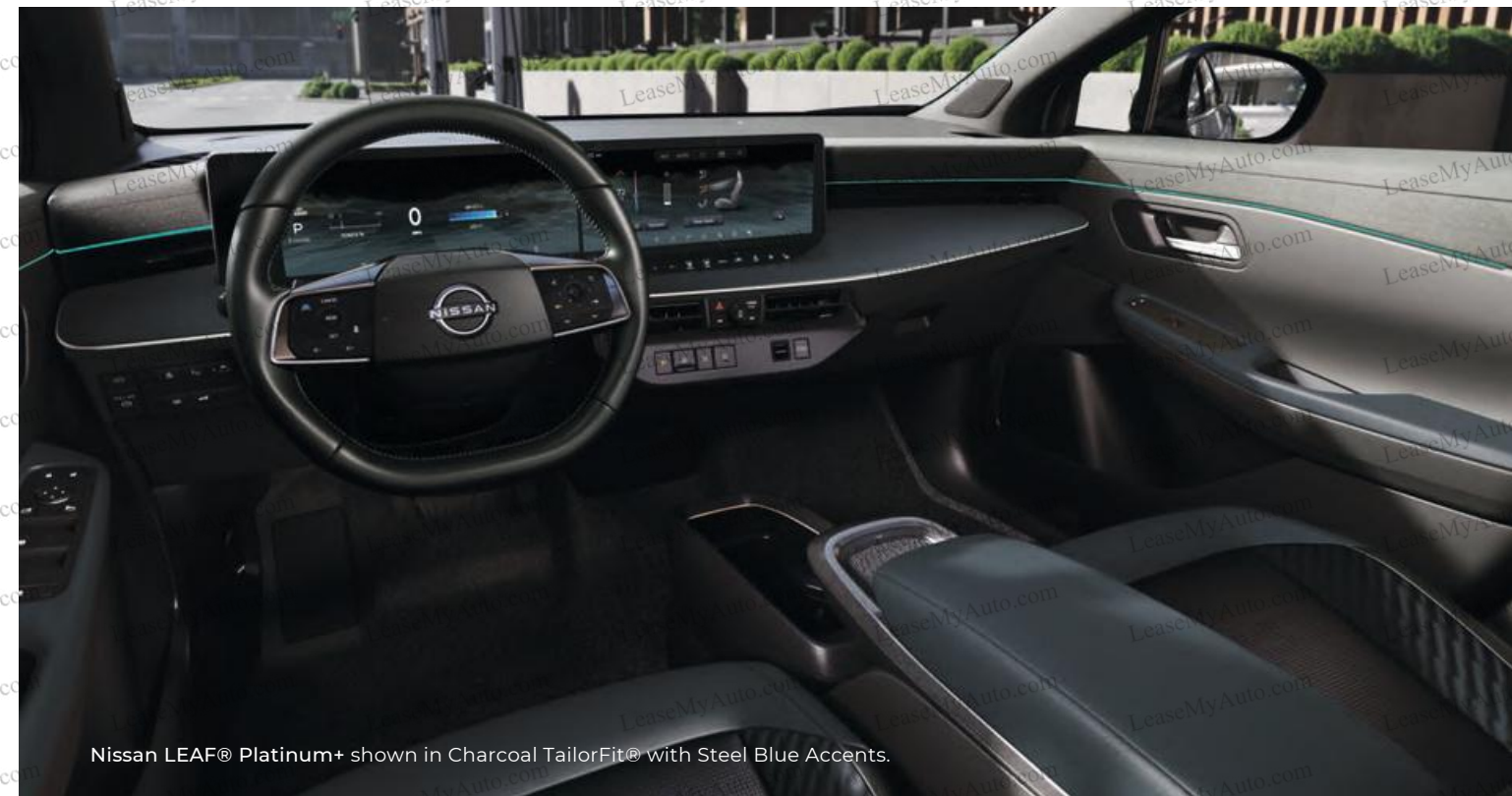
Nissan LEAF® Platinum+ shown in Charcoal TailorFit® with Steel Blue Accents.

■ Standard Nissan has taken care to ensure that the color swatches presented here are the closest possible representations of actual vehicle colors. Swatches may vary slightly due to the printing process and whether viewed in daylight, fluorescent or incandescent light. Please see the actual colors at your dealer.