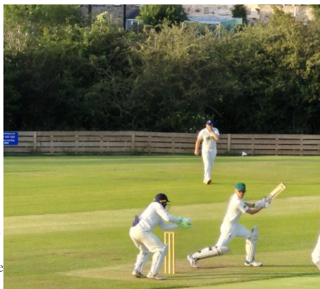
Action from Whiston Forge v Waterworks in Division South A