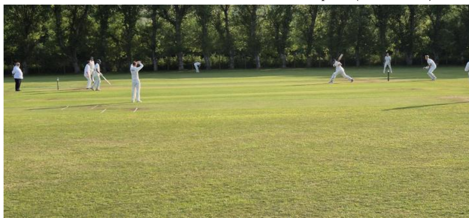
Action from Outokumpo v Holmesfield in Division South A

With Hollinsend and Sheffield Transport neck and neck at the top, and Brookhouse just three points behind, the race for the title is heating up