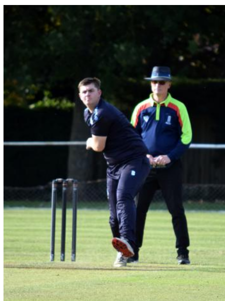
The League's U21 representative team in action against Yorkshire CCC U18s. Report Page 19