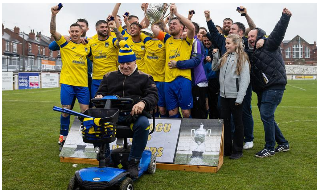
2024/25 winners Westville will be looking to retain the trophy

Last season's final saw Westville edge out AFC Pewter Pot with a 2–1 victory in a closely contested match at Hampden Road. Striker Josh Moore was the standout performer, scoring both goals for