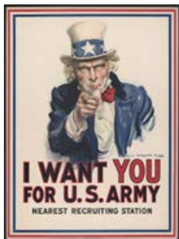
Queensland's national parks need you too.

The lesson from history for me is securing a national park is never easy and its ongoing management requires research and work - our association has a vital role to play on both fronts. We work towards growing the park estate, improving its management and increasing public awareness of park values. That is why we currently have several fundraisers underway and a $10 membership offering. Scores of new members from all walks of life have expressed their support for our work - a very heartening achievement. If you are not a member, or know somebody who you think should support our work encourage them to visit npaq.org.au to find out how they can join and get involved.