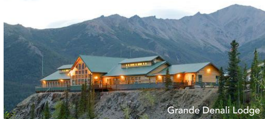
Grande Denali Lodge