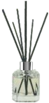
CRYSTAL SQUARE diffuser