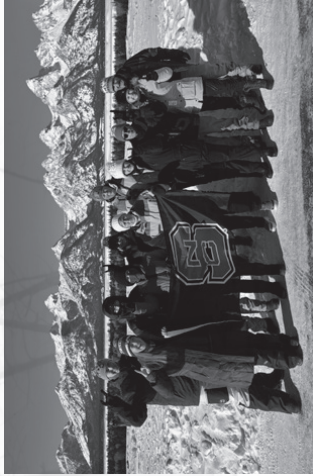
NC State alumni on Orbridge's Wolves and Wildlife of Yellowstone 2025 travel program.

NC State Alumni Association Box 7503 NC State University Raleigh, NC 27695-7503