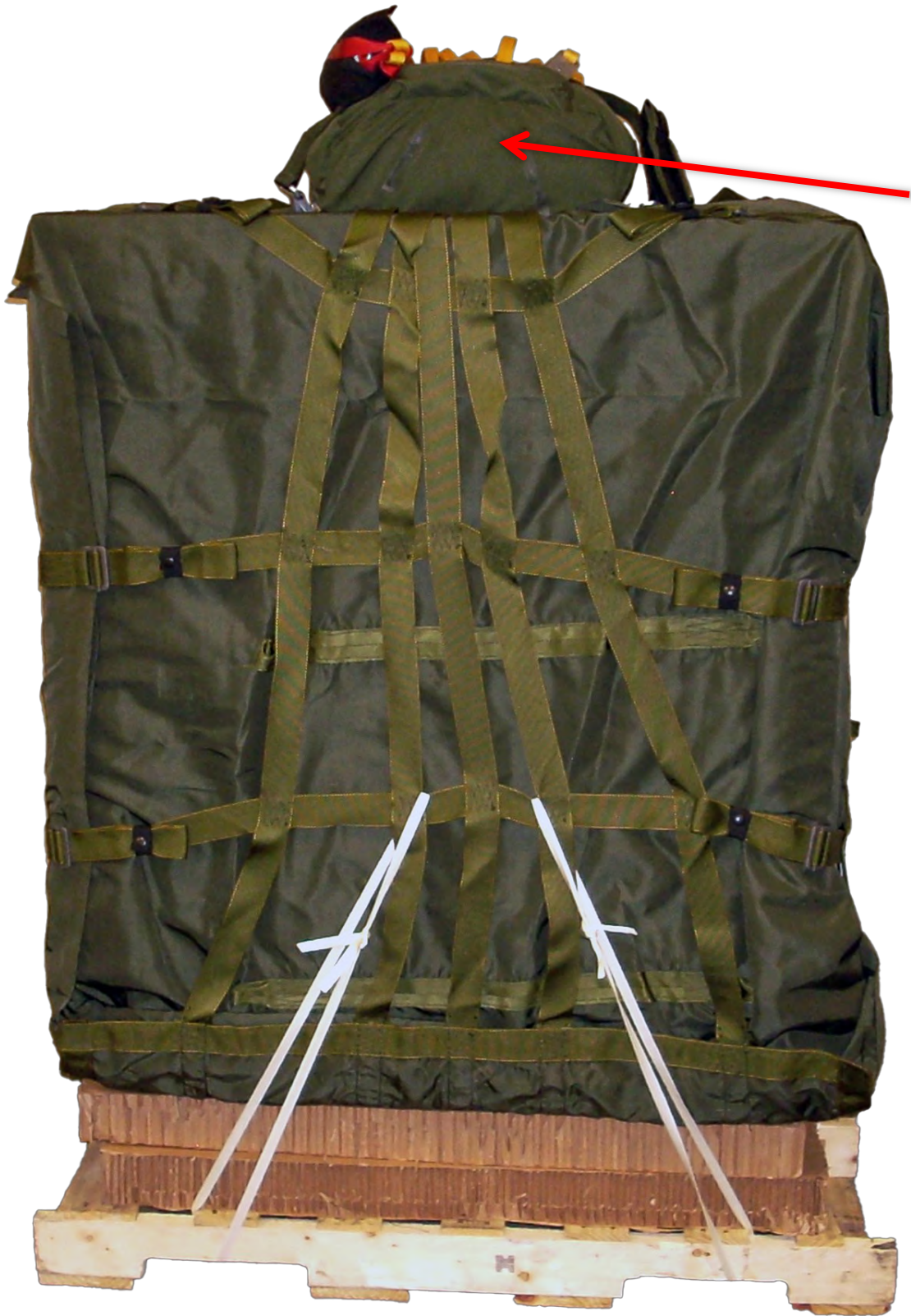
The Cargo 10 atop an 800 lbs. (363 kg.) delivery pallet.