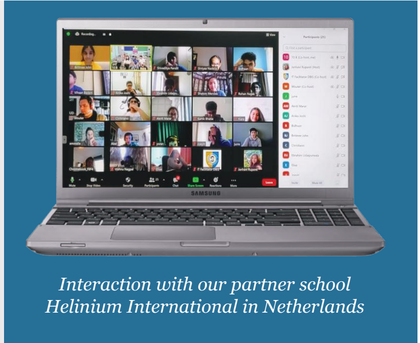
Interaction with our partner school Helinium International in Netherlands