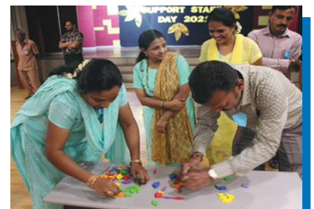
Support Staff Day @ DBIS