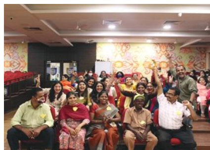
Support Staff Day @ DBIS