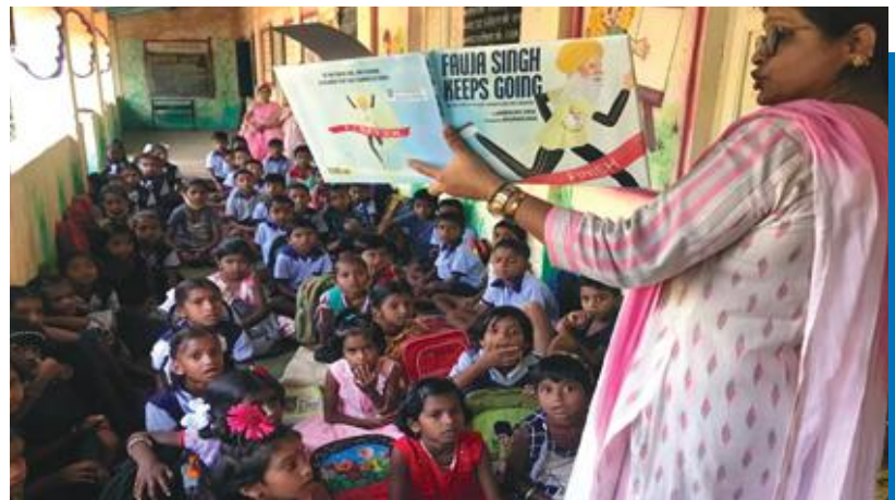
-Visit to Zilla Parishad School

All the stakeholders of DBIS are a part of a big family and this Diwali the teachers contributed for our ever so hardworking and warm Support Staff. They are our support system without which DBIS would not be able to function as effectively as it does. 22nd October was celebrated as Support Staff Day at DBIS where the students came together to organise an assembly expressing their heartfelt gratitude and the teachers organised games and offered them a token of love and appreciation in the form of Diwali Gifts.