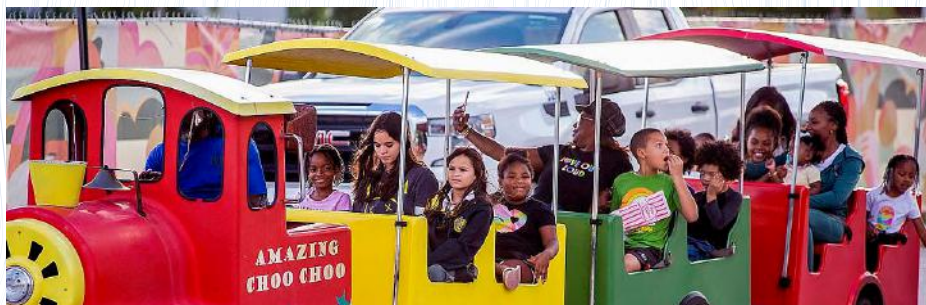
All Aboard! First Friday fun in the sun at Centennial Park