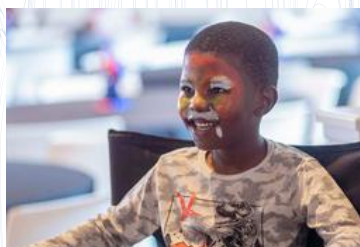
First Friday at Five Face Painting