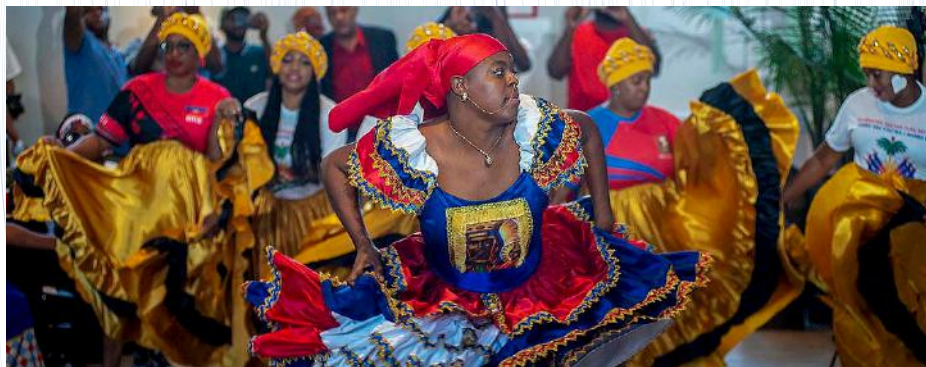
Haitian Flag Day Dance and Drum Workshop