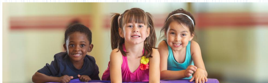
Joy Deco Gymnastics Class