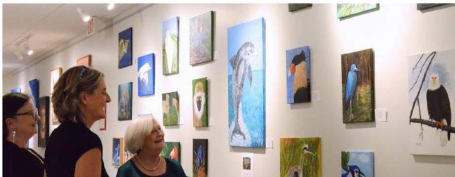
The Saturday Morning Collection Reception

A Joyful Look at Cultural Arts in Motion