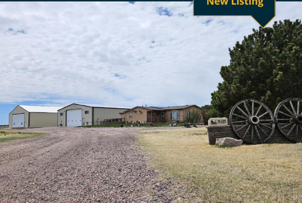
DEUEL COUNTY, NE