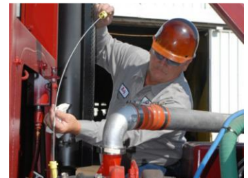
Easily Accessible Daily Checks