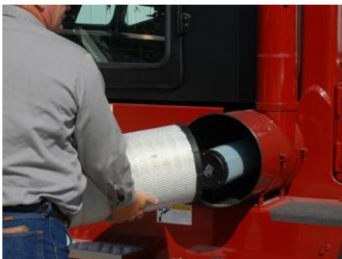
Donaldson Air Cleaner with Safety Element (Standard)