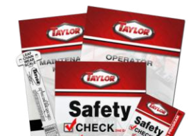
Vehicle Information Package (Standard)