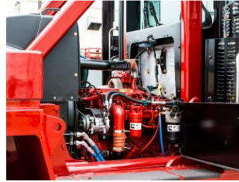
Easy Access to Drive Train & Hydraulics