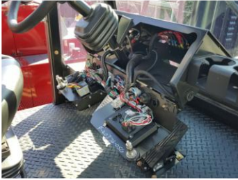
Flip-down Dash with Color/Number Coded Wiring (Standard)

Taylor Lift Trucks are designed with ease of maintenance and serviceability as a key priority. With today's engine and emissions requirements, daily maintenance checks and timely periodic service are the key to your equipment's longevity. All daily checks across the Taylor product line can be accessed from the ground or running board, ensuring that operators can complete these requirements with ease. Also, the sliding hood (on rollers), side service doors and removable floor panels open to expose the drive train and hydraulics to provide easy access for service and inspection.