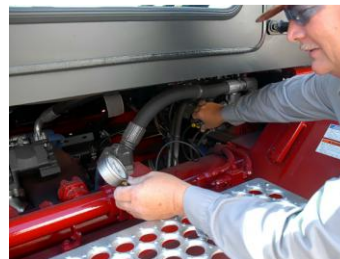
Service & Inspection from Ground Level