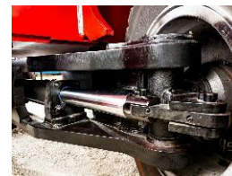
Industry's Toughest Steer Axle (Standard)