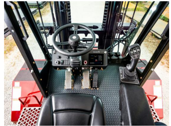
Fully Enclosed 2-Door Cab with Multiple Climate Control Configurations Available (featured cab is shown with available options)