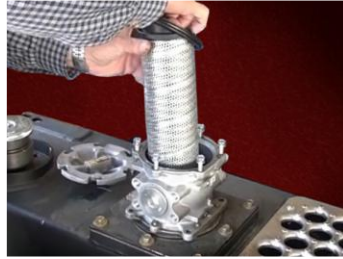
Spin-on Breather, Wire Mesh Strainer & Replaceable Internal Element (Standard)