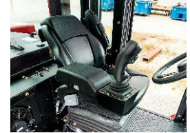
Fully Adjustable Air Ride Seat (Standard)