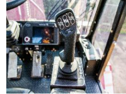
11 Button Command Joystick (Standard)