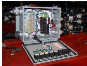
Heavy Duty Circuit Breakers/Reset Switches (Standard)