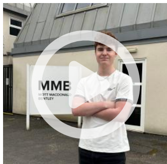
Reece Wellsbury Engineering Level 3 Diploma