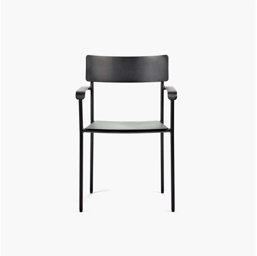
August chair by Vincent Van Duysen