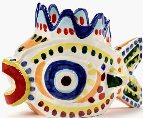
Sicily vase by Ottolenghi & Ivo Bisignano