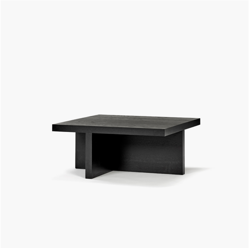
Rudolph coffee table by Vincent Van Duysen