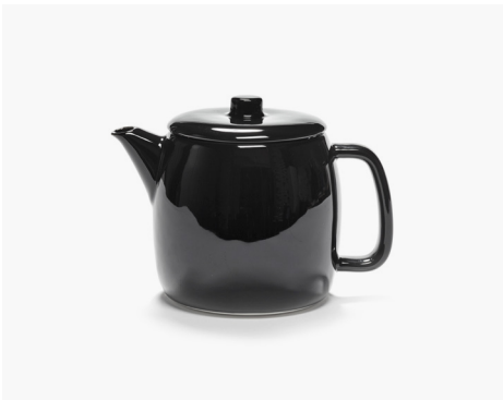
Vincent Van Duysen