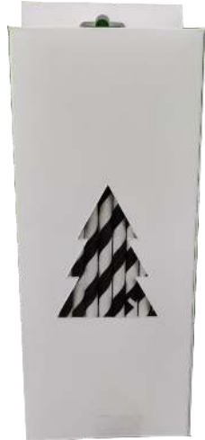
ECO FRIENDLY PACKAGING