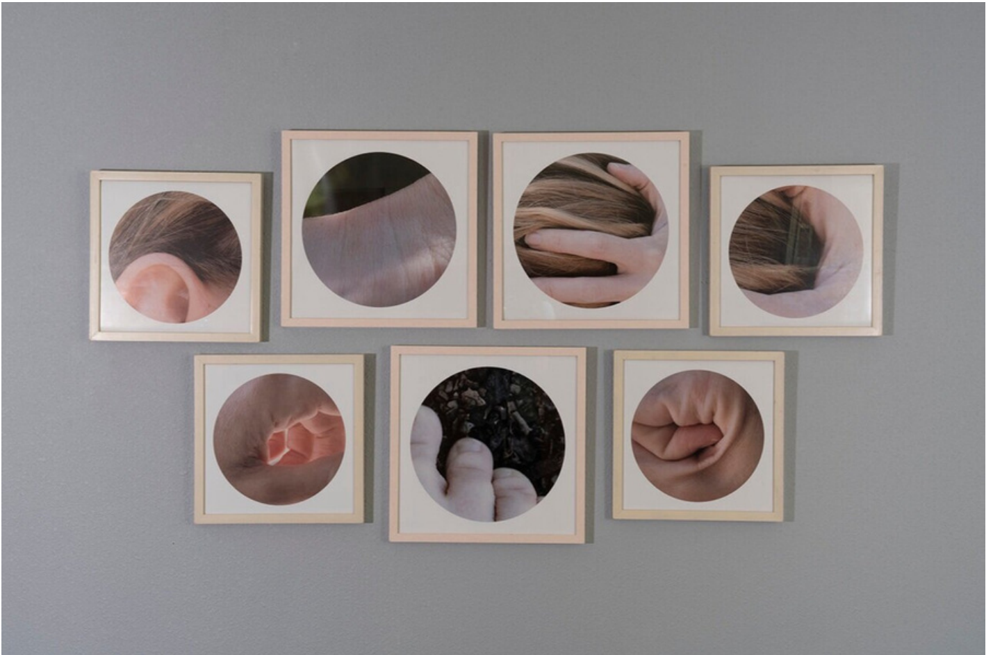
Jennifer Van , Encircle 1-7 , Archival Inkjet Prints, 68" x 36" (three 17"x17") (four 14"x14")