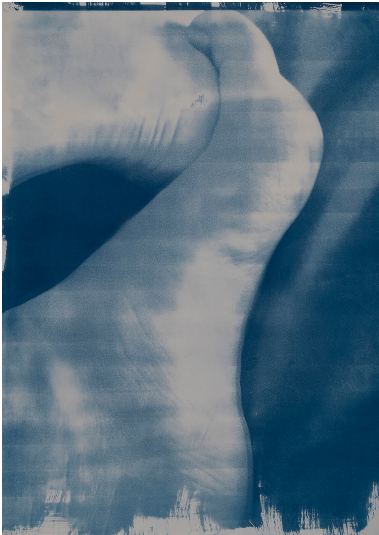
Jennifer Van , The Spaces In Between #1 , Cyanotype, 24" x 17"