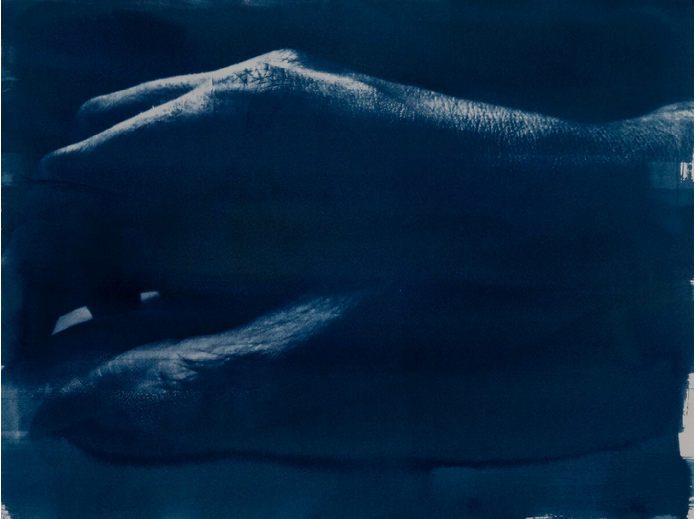
Jennifer Van, The Spaces In Between #4 , Cyanotype, 20" x 15"