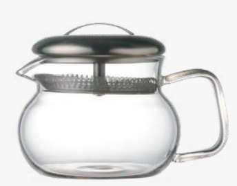
Dancing Leaf Tea Pot