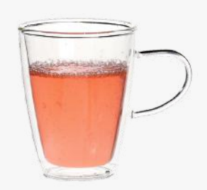
Double Wall Glass Mug