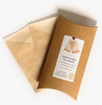
Disposable Tea Bags