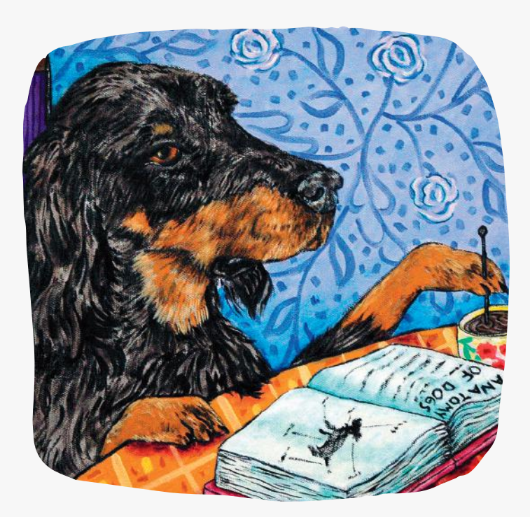
BLACK TEA BASED