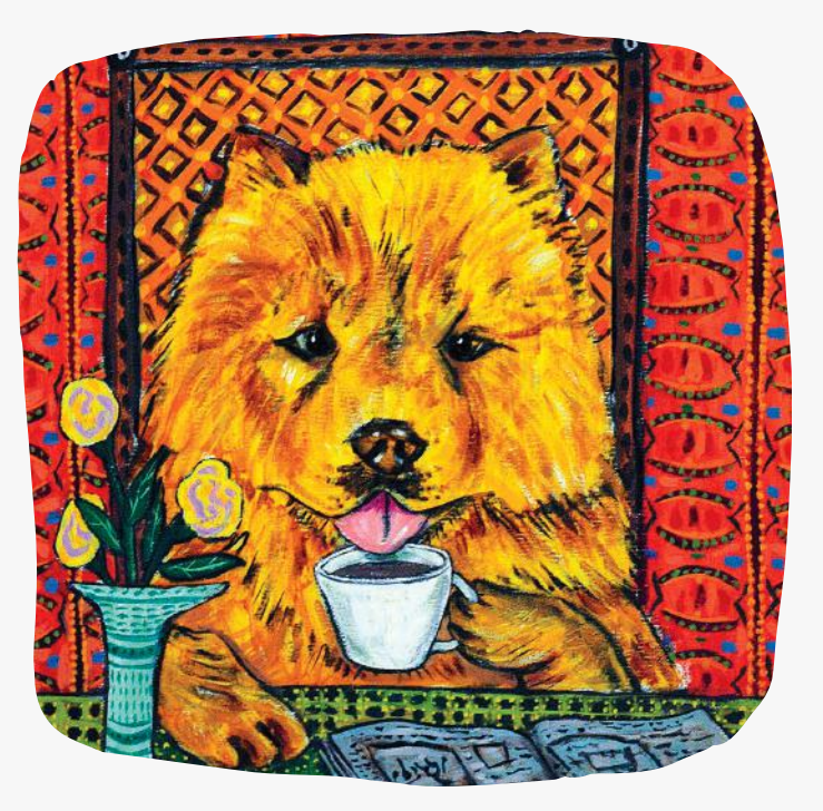
HERBAL TEA BASED

The original meaning of "chai" is "tea" in the Hindi language and "masala" means "spiced". Dating back thousands of years in India, the traditional chai tea was just a blend of healing spices. When the British colonized the country, they added the Western combination of black tea, milk and sugar, transforming the simple "masala chai" into what we now describe as a "chai".