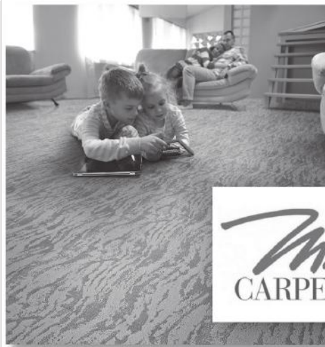
Pictured above - Masland Carpets & Rugs - Linx in Woodlands

Stop by Creative Carpet & Flooring to claim your prize by March 31, 2022!