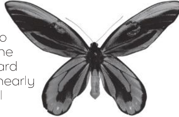
Queen Alexandra Birdwing Butterfly Anshul Fernando, Jan 23, 2016

It turns out that the world's largest butterfly isn't all that easy to find. You'll have to venture to the coastal rainforests of eastern Papua New Guinea to find the Queen Alexandra Birdwing, also known as the Birdwing Butterfly. Named for the wife of King Edward VII of England, the wingspan of females can reach nearly a foot wide, up to 50% larger than the more colorful males, and nearly 11 inches wider than an average butterfly. Birdwing caterpillars feed on poisonous vines, making them toxic to predators. Unfortunately, deforestation and habitat loss has threatened the population in recent years, but conservationist groups are working to raise awareness of this rare and impressive butterfly species. [Scientific American | July 2020]