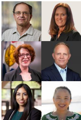
Speaker names are listed clockwise, beginning from the top-left corner.