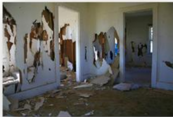
Malicious Damage Guarantee

ProtectionPlus provides peace of mind and real financial protection for property owners. Offered exclusively through professional property managers, this coverage helps protect against tenant damage, unpaid rent, and the high cost of evictions. It also includes coverage for theft, liability claims, service animal damage, and other unexpected events that can affect your rental income. With ProtectionPlus, owners gain an added layer of security knowing their property and finances are protected from the unforeseen.