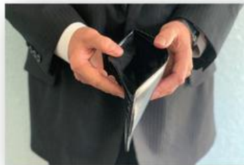
Loss of Rent Guarantee