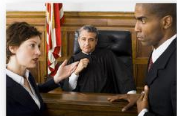
Eviction Cost Guarantee