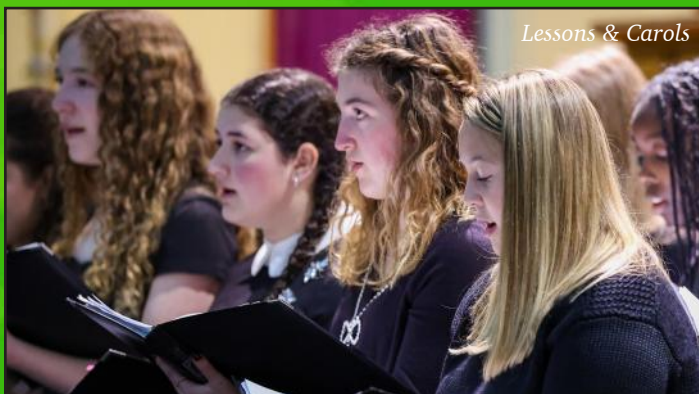
Lessons & Carols