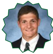
Charlie Hickey Indoor Track & Field