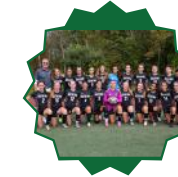
Girls Varsity Soccer Team