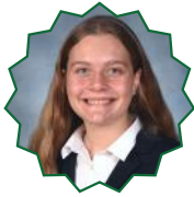
Klara Masterpol Indoor Track & Field