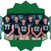
Offensive Line Football