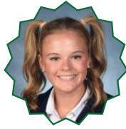
Grace Buser Indoor Track & Field