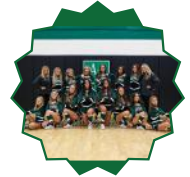
Competition Cheer Team