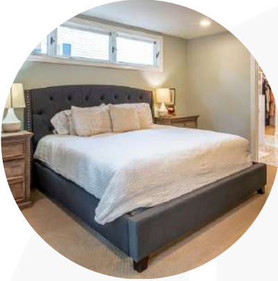
Retail Made Ups