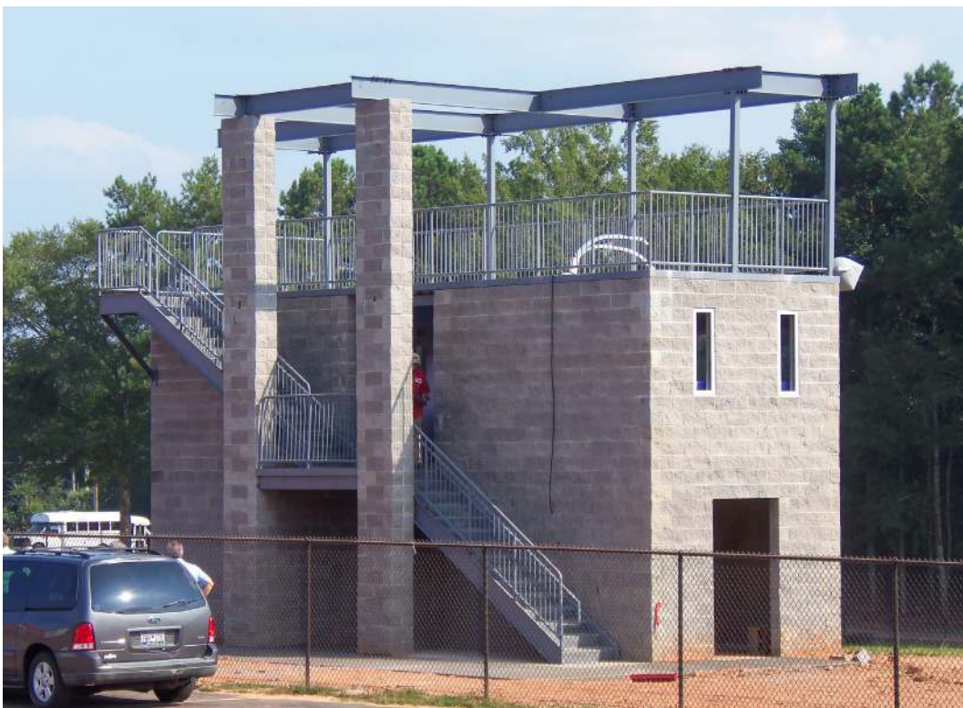
Abbeville High School’s Hite Stadium is getting a new press box.

“We are currently looking for help if anybody might be interested,” he said.