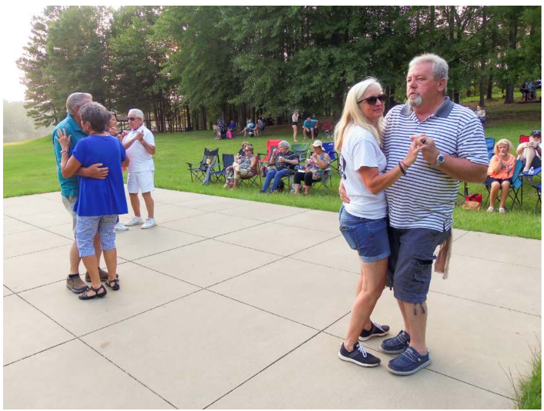
These dancers were moving to the beat of the band Silver recently, during a concert presented by the Calhoun Falls Chamber of Commerce at the Blue Hole recreation area in Calhoun Falls.

Abbeville will not be the only local team in the WCTEL Classic. Dixie and Calhoun Falls Charter will face each other in the last segment of the event, which begins at 6 p.m.