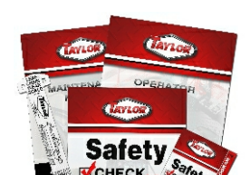
Vehicle Information Package (Standard)