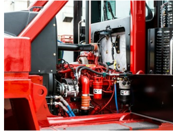
Easy Access to Drive Train & Hydraulics