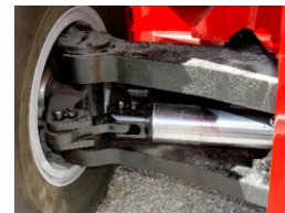
Industry's Toughest Steer Axle (Standard)