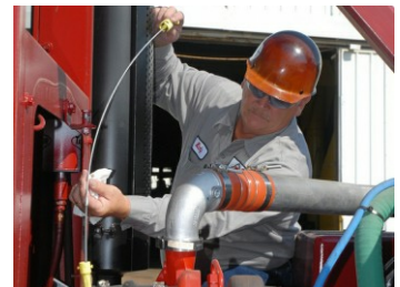
Easily Accessible Daily Checks