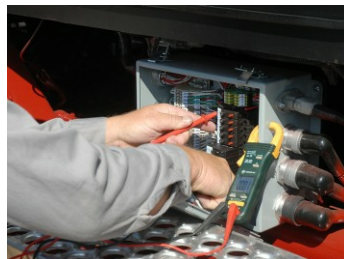
Heavy Duty Circuit Breakers/Reset Switches (Standard)