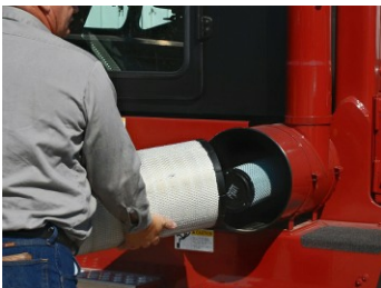
Donaldson Air Cleaner with Safety Element (Standard)