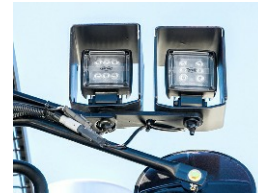
8 LED Work Lights (Standard)