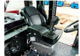
Fully Adjustable Air Ride Seat (Standard)