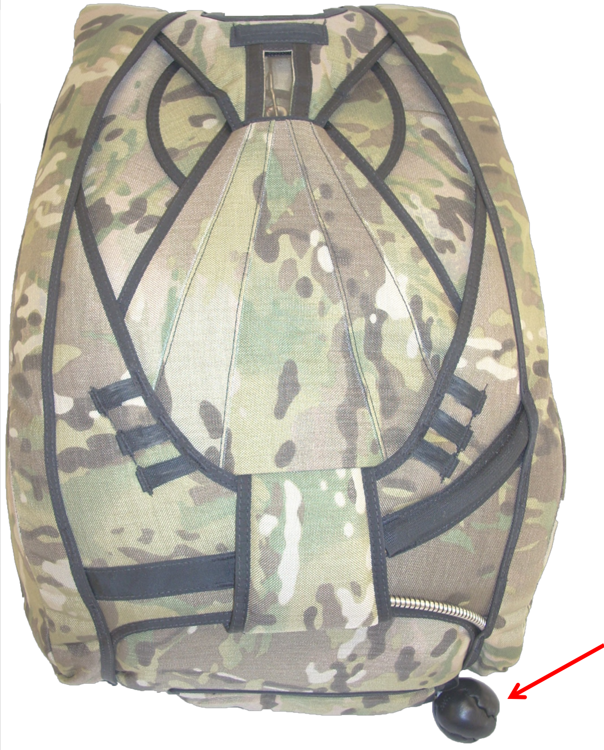
Throw-out Pilot-chute with Hacky Handle on BOC