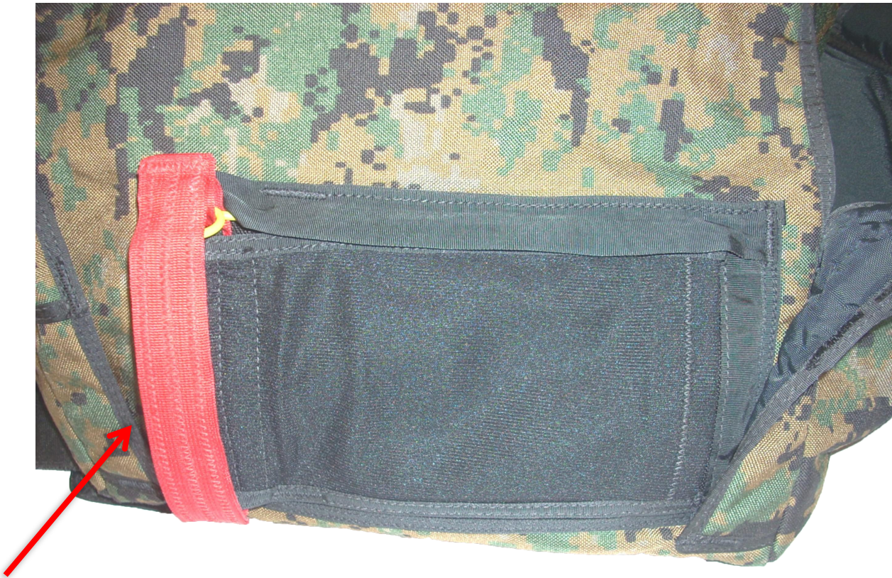
AFF Jumpmaster Handle for Throw-out Pilot-chute