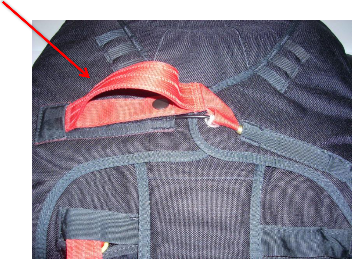
AFF Jumpmaster Handle for Spring-loaded Pilot-chute