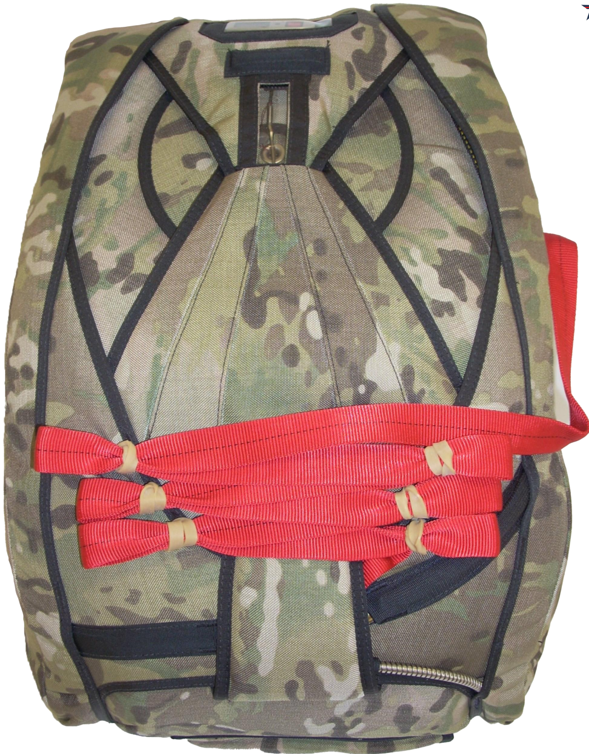
The TPDS-LLT Light Load Tactical Parachute Assembly with Static-Line. Direct Bag, Spring-loaded Assist or T/O Pilot-chute Assist