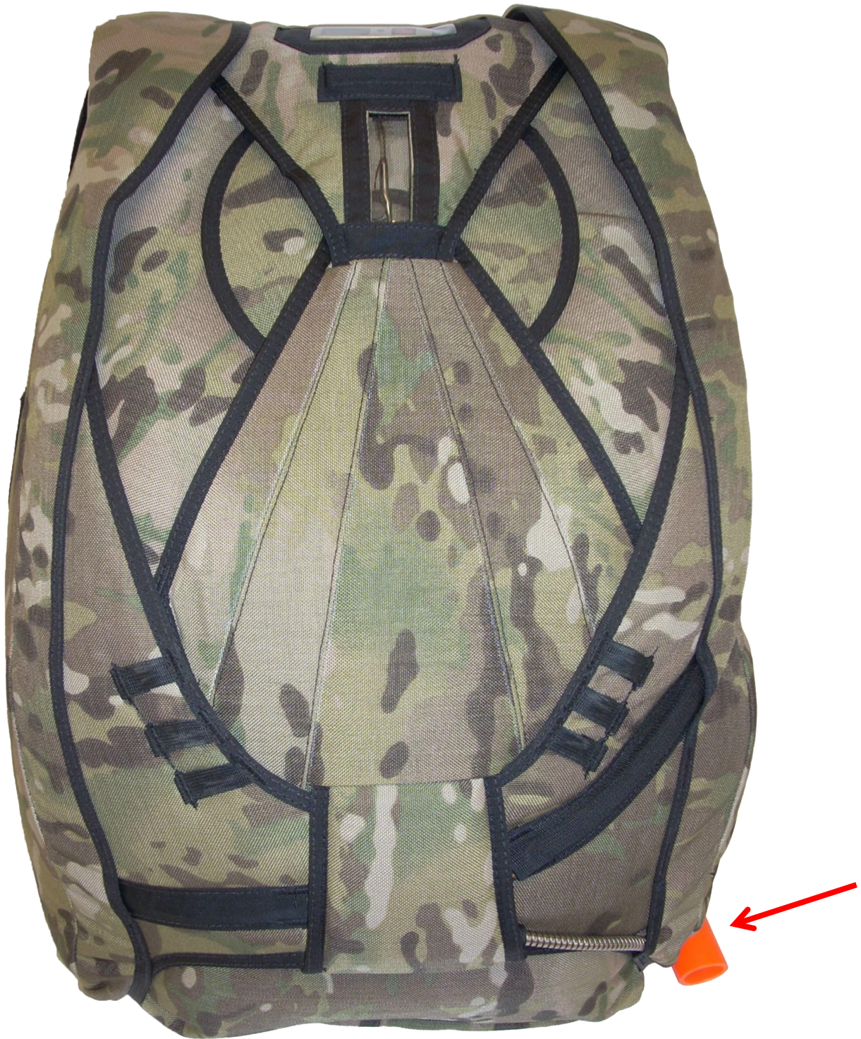
Spring-loaded Pilot-chute with Plastic BOC Handle