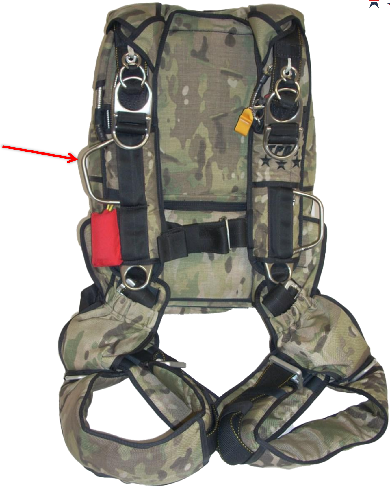
Spring-loaded Pilot-chute with Stainless Steel "D" Handle.