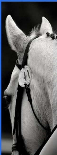
Session A Apr 23-24