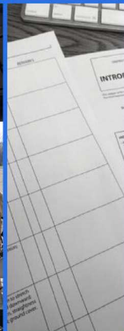
Session C Aug 20-21