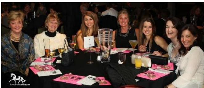
2010 Awards Gala