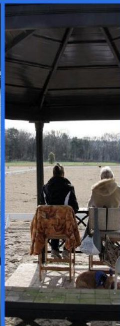
Session B July 9-10