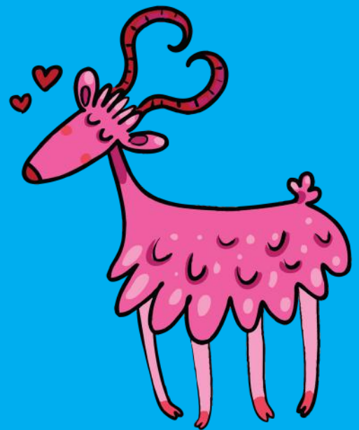
GOAT—Greatest Of All Time

Thompson & Assoc. Equine Med Todd Kroupa Team Real Estate Triple Crown Feed Unlimited Dressage USDF Virginia Woodcock Whole Horse Saddle Fit / Lacey Halstead Wilsun Custom Horse Blanket Zan Economopoulos Fine Art Zaudke Sculpture