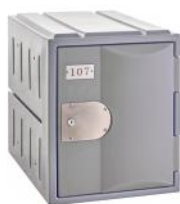
Quarto locker 460 H x 385 W x 500 D mm