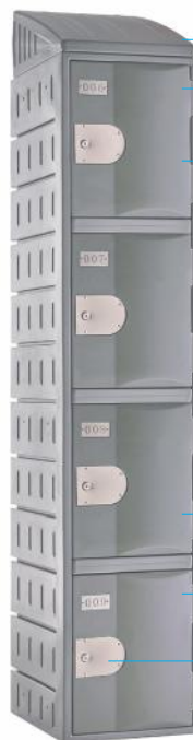
Four door locker 1810 H x 385 W x 500 D mm Sloping top adds 148mm to height