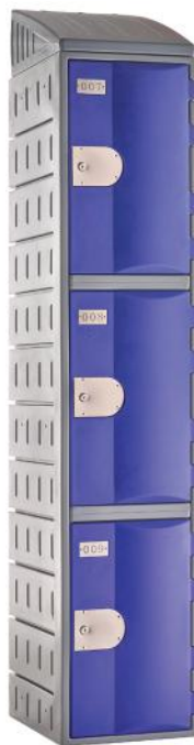
Three door locker 1810 H x 385 W x 500 D mm Sloping top adds 148mm to height