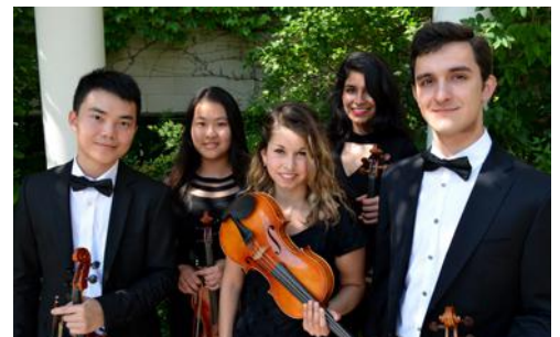
A portion of the 2017 violin section