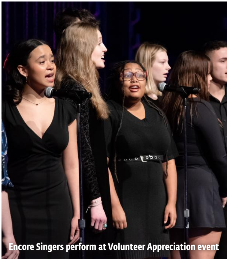
Encore Singers perform at Volunteer Appreciation event