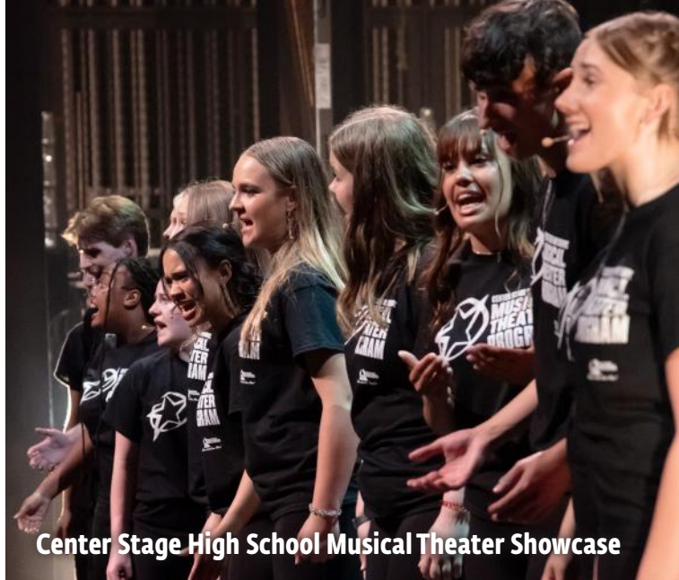
Center Stage High School Musical Theater Showcase