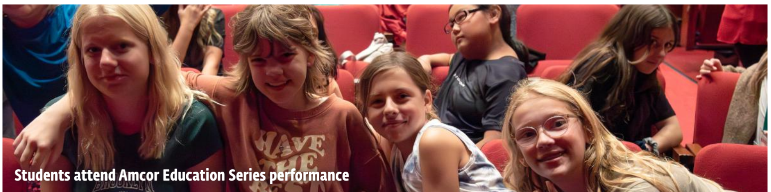
Students attend Amcor Education Series performance

**Fund within the Community Foundation for the Fox Valley Region ***Fund within the Shawano Area Community Foundation ****Fund within the William J. and Barbara A. Schmidt Family Foundation ++ with gift matching funds from the McCormick Foundation