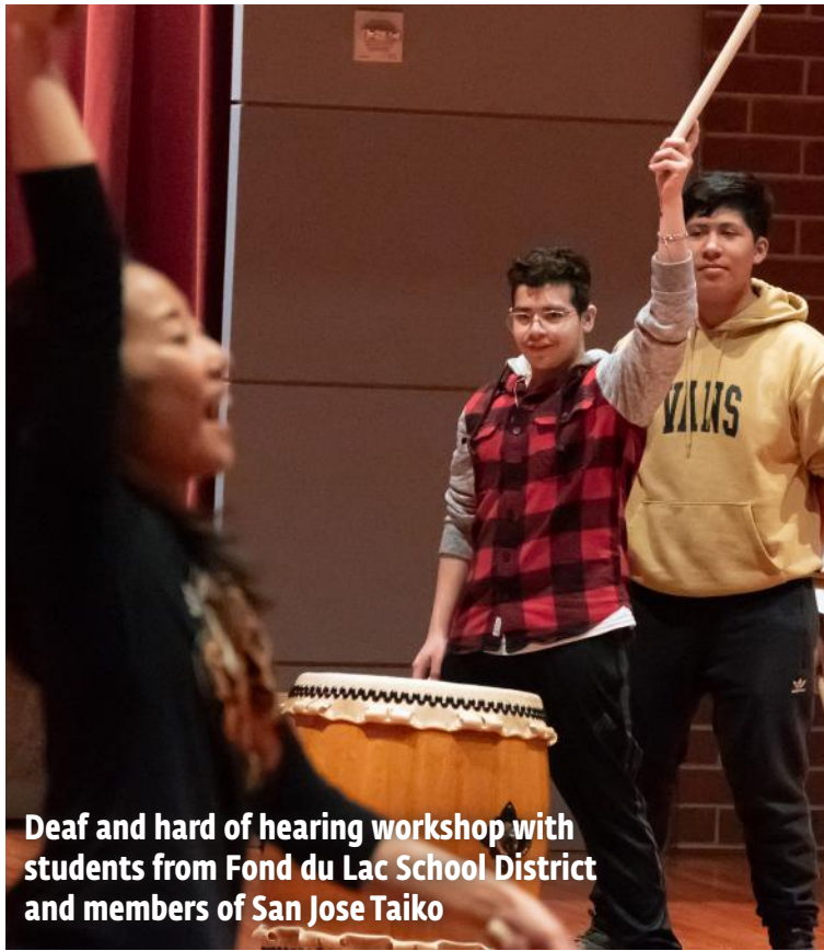
Deaf and hard of hearing workshop with students from Fond du Lac School District and members of San Jose Taiko