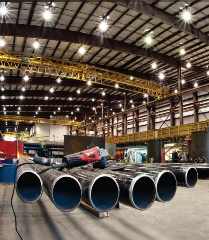
Large Fabrication Bay (420ft x 85ft x 45ft)