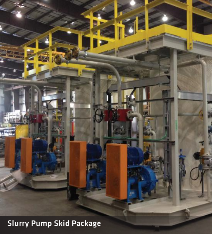
Slurry Pump Skid Package