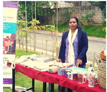
PSBB MILLENIUM SCHOOL

Bosch Ltd. celebrated December as a disability month and for that purpose they invited few NGOs across different sectors to keep stalls at their huge campus Hosur Road Adugodi. BGCT also participated and kept a stall at the event.