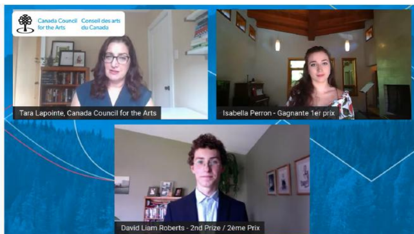
The online award ceremony held on July 24, 2020