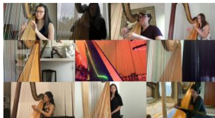
Electric Counterpoint - Steve Reich Featuring Harp Faculty, 2020 Harp Musicians and NYO Canada Alumni