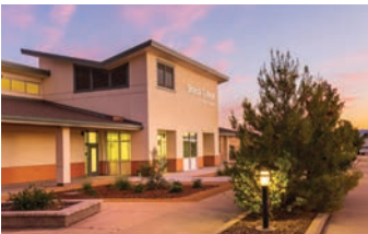
Tehama Campus | Red Bluff

HYBRID: We have hybrid-style fitness classes with video instruction (pg. 6), as well as some personal growth classes in poetry and how to present yourself in public (pg. 11 and 15).