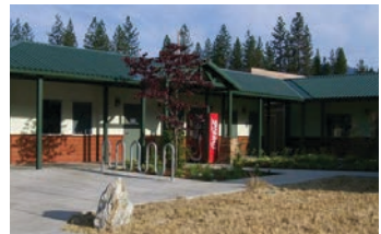
Trinity Campus | Weaverville