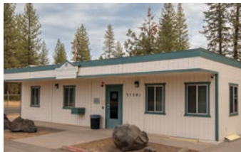
Intermountain Campus | Burney