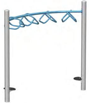
J2 Curved overhead handle ladder