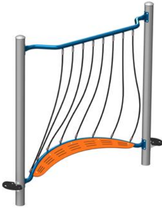
J2 Rope Bridge